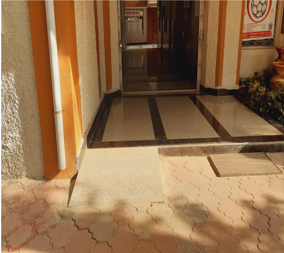
Ramp : College Entrance

DST-FIST Supported & Star College Scheme by DBT.