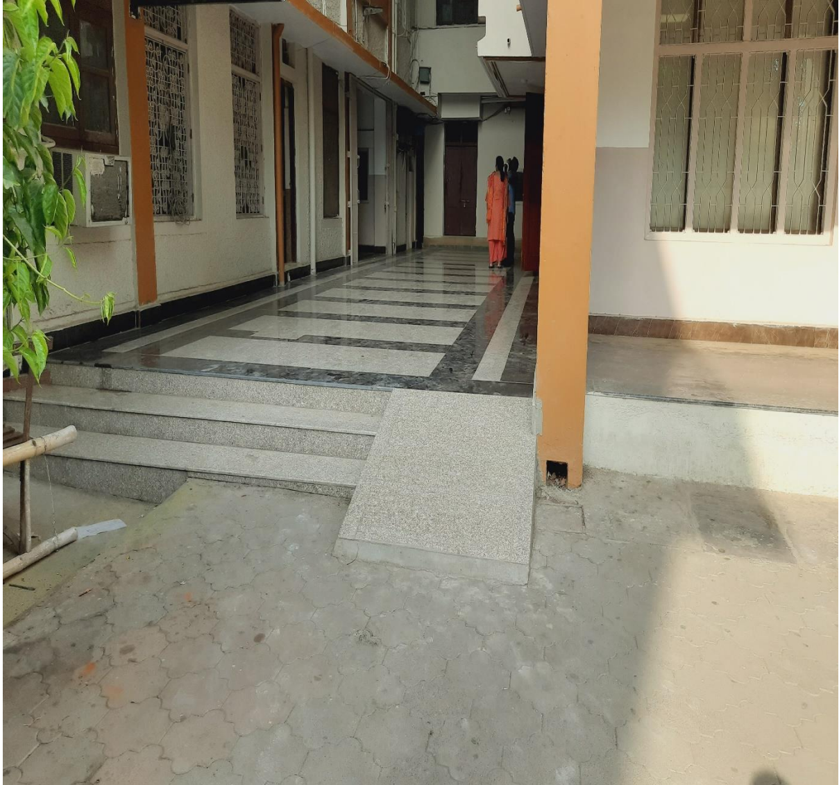
Ramp: Science Block

DST-FIST Supported & Star College Scheme by DBT.